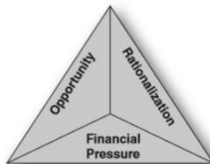
Figure 1: Fraud Triangle

Source: Singleton T.W. & Singleton A.J. (2010). Fraud Auditing and Forensic Accounting. Wiley.