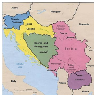
Figure 1. New Independent Countries in Former Yugoslav Federation Lands

Arriving West Balkans in 7 th Century, Croats established their kingdom in X. Century. However, Croatian territory was conquered first by Hungarians in 11 th Century and later in 16 th Century by Otoman Empire with the Mohacs War. Upon the failure of second siege of Vienna, Croats was conquered this time by Austro-Hungarian Empire. With the separation of Austro – Hungarian in World War I, Croats joined to Yugoslavian Kingdom. After the Nazi occupation in World War II, Croats, just like their neighbors, joined Yugoslavian Socialist Federation. In 1991, Croats declared their independence (Oliver, 2006: 140 – 144).