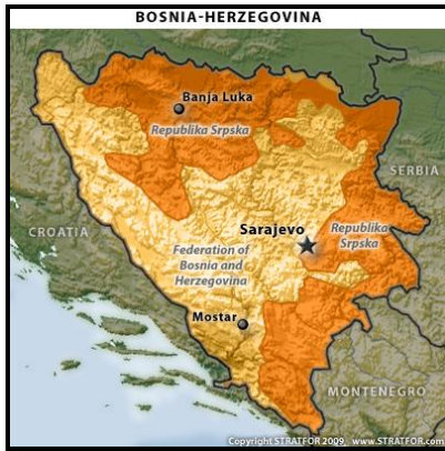
Figure 2. Bosnia and Herzegovina Political Map

The post-Dayton state-building process has also been deeply affected by the broader ideological overtones of contemporary global capitalism, with its deep distrust of activist and interventionist government. Somewhat paradoxically, therefore, the post-war Bosnian state is often simultaneously defined as both under-developed and over-intrusive: lacking basic capacities and competencies to exercise effective governance while continuing to wield inordinate influence over the remains of the Bosnian economy (Donais, 2005: 47).