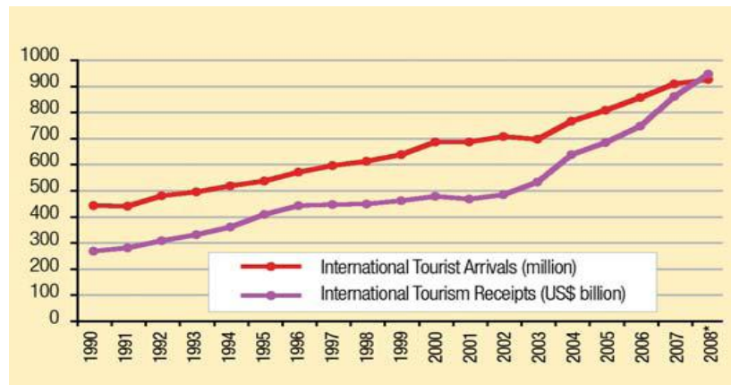
Table 1: International Tourist Arrivals and International Tourism Receipts Source between 1990-2008 Source: World Tourism Organization