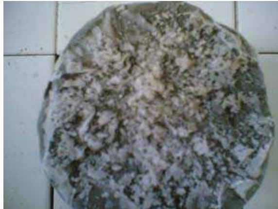
Fig. 1 Crystallization on surface after the freezing

Freezing-thawing strength was determined according to “Methods for Freezing and Thawing Tests of Compacted Soil-Cement Mixtures” indicated in ASTM D560 (1985). In this experiment, samples are stored in a freezer at -20° C for 24 hours. Then, the same samples are stored at the room temperatures at 18° C for 24 hours. This process is called as one cycle. 12 cycles are carried out for the samples in this experiment after which the surfaces of the samples are brushed gently with wire brush to remove particles. Then, they are weighted to determine the percentage of the loss compared to their previous weight. The highest loss rate accepted in the literature is 15%. The surface crystallization and the sample deformation after the cycle are given in figure 1 and figure 2 respectively.