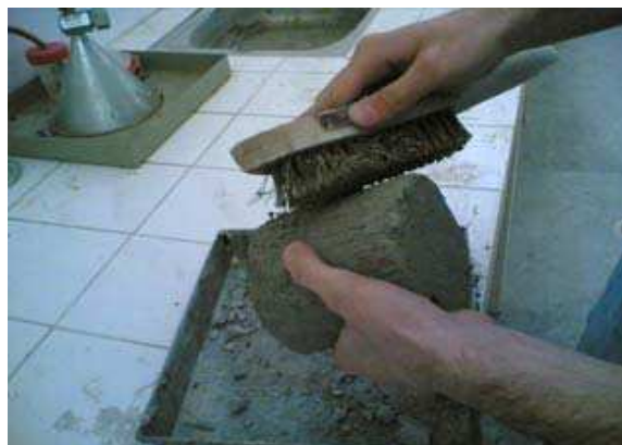
Fig. 2 Deformation after the cycles