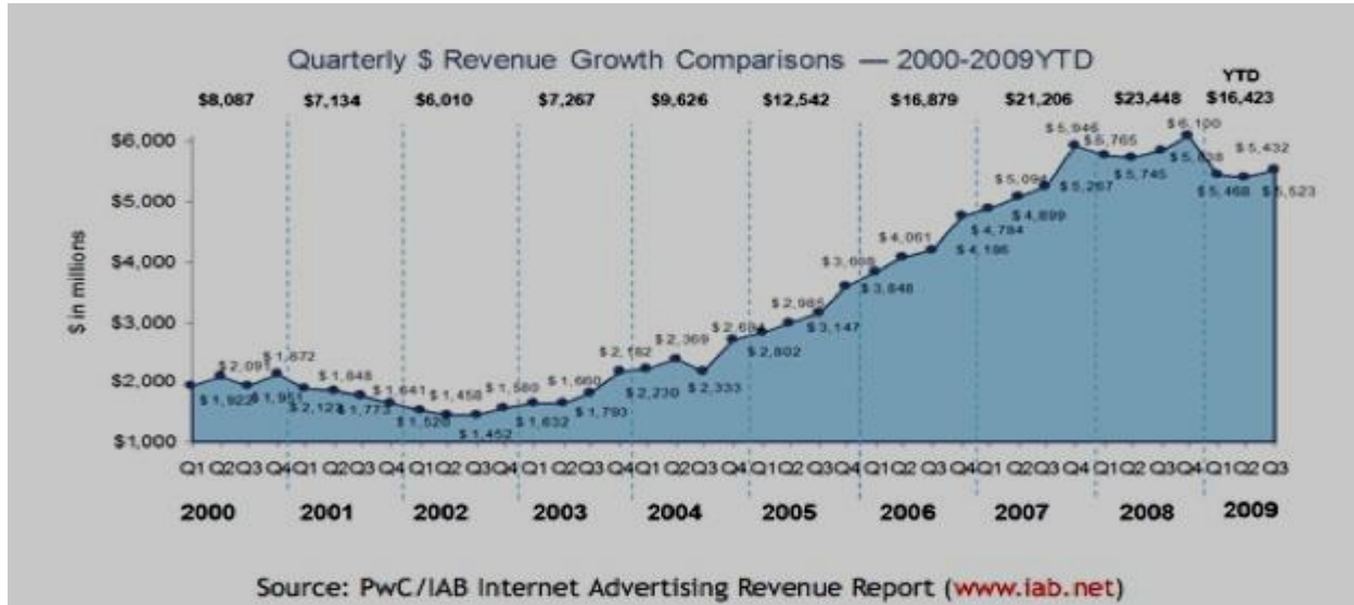
Table 3. Online Advertisement Revenue in USA

9. Online advertisement has a day by day increasing marketing share on internet which is the most important branch of E-Tourism.